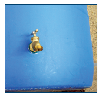
Figure 17. Hose bib facing down.