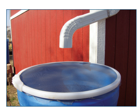
Figure 20. Ideal placement of a barrel.

Be sure everyone knows that the water in the barrel is not safe to drink. Put a non-potable label on the barrel or remove the faucet handle when not in use.