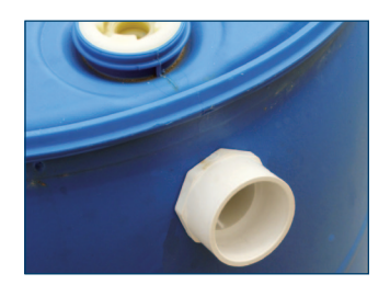
Figure 15. Step 3c.