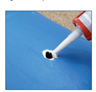
Figure 11. Step 2b.