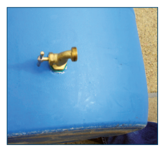
Figure 18. Hose bib facing to the side.