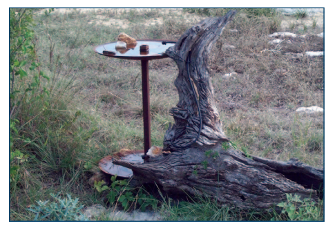
Figure 23. Bird bath made from a plow disc with a drip emiter in an old log.