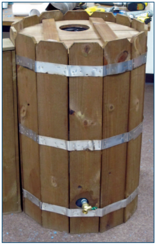
Figure 19. Covered rain barrel.