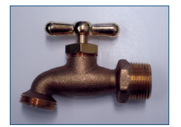
Figure 4. ¾-inch hose bib.