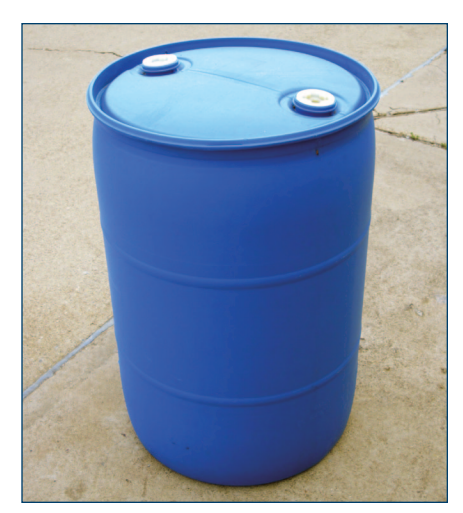
Figure 3. Barrel with a sealed lid.