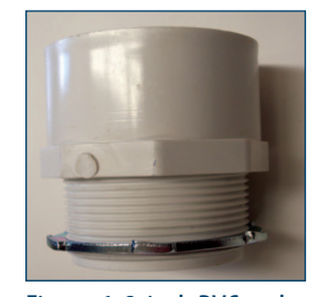
Figure 6. 2-inch PVC male adapter and electrical nut.